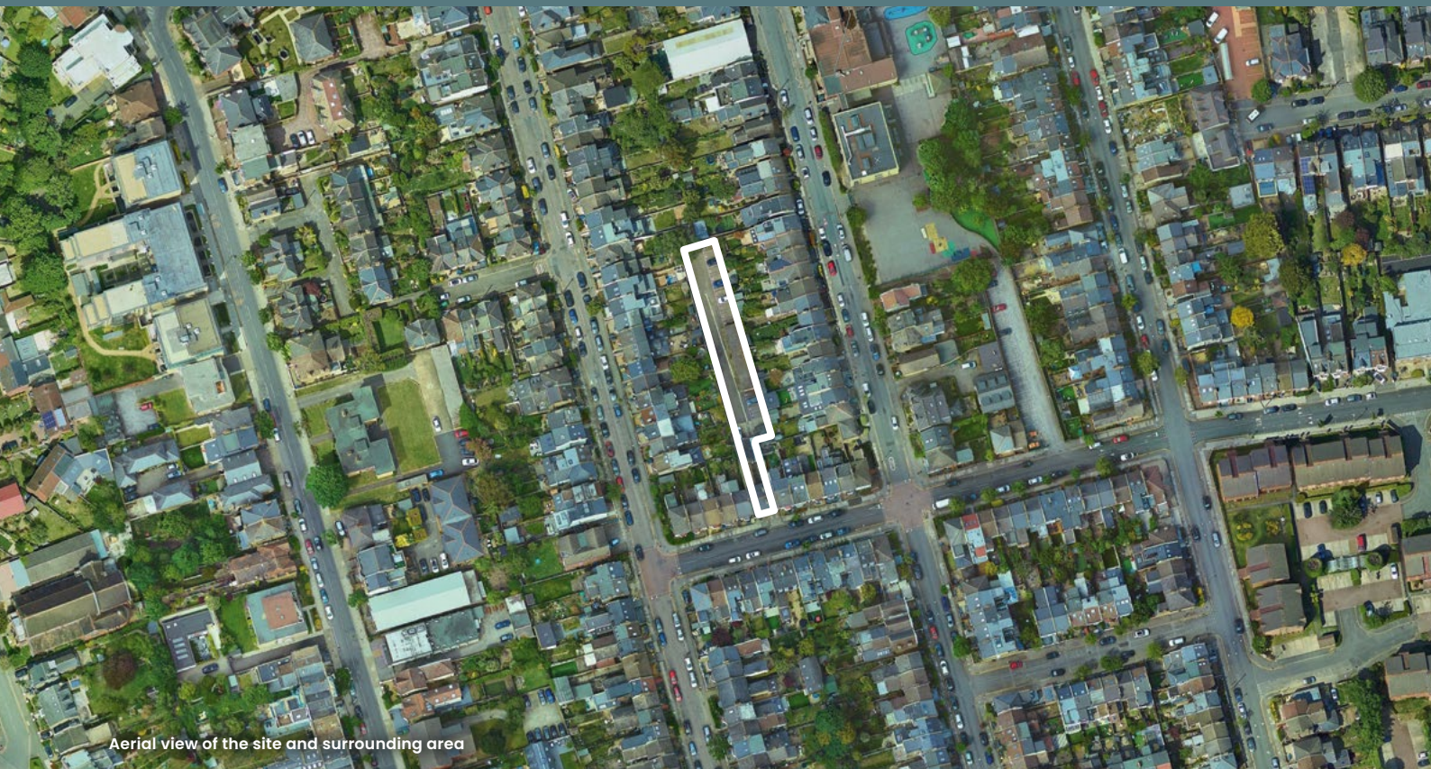
Aerial view of the site and surrounding area